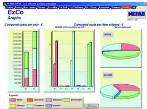
4. Finally bars and diagrams will make the cost comparison picture clear. EXCO also provides the possibility to make printouts.

Export shipments require optimised packaging solutions both regarding protection and from from costing viewpoint. EXCO will guide You.