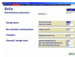
2. Financial, storage and labour costs are collected