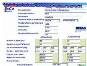
1. Detailed info about the product and shipment is gathered incl. packaging volume and weight