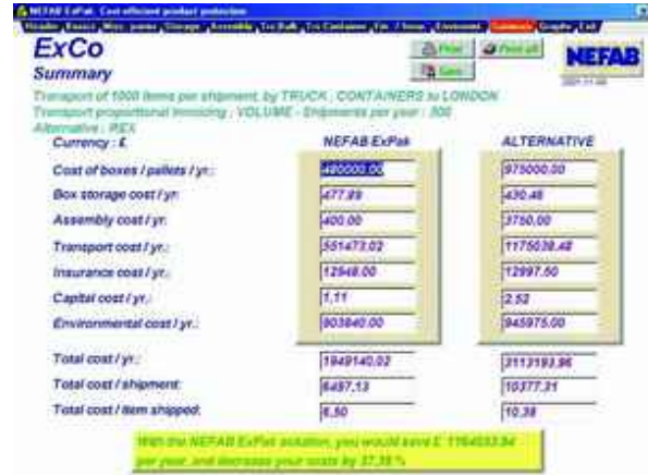
3. All cost figures are summarised in a table incl. a cost figure per item packed.