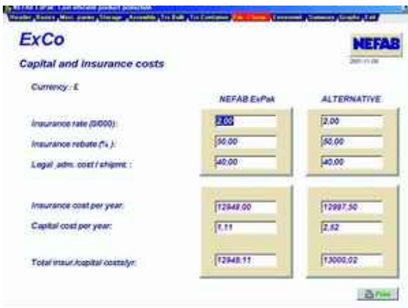
2. Also insurance and capital costs might influence the final decision. EXCO will give the answer. Cost for damages is normally a "hidden" cost but have frequently a major influence on cost and customer image related issues. Possibility to reuse a package could be an added value.