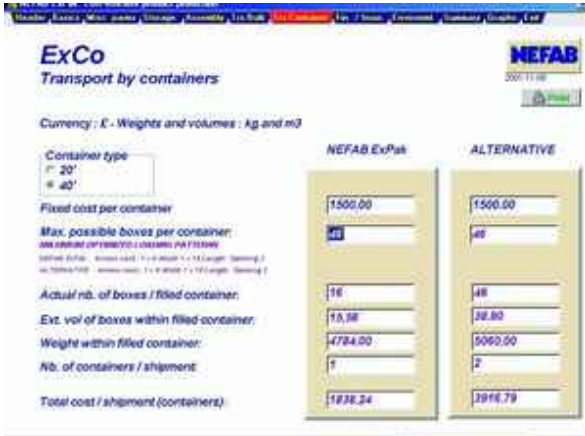
1. EXCO will give you the cost figures for the transportation and also consider weight limits for trucks and containers

EXCO will give you necessary reports and graphs for a first judgement of the cost saving possibilities in the field of export packaging. A Cost calculation will be presented with costs on a yearly basis for the alternatives. Also the cost figures will be distributed on the different cost centers like boxes, assembling, storing and transport as examples.