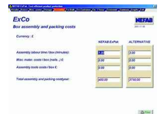
4. Assembling time and costs for this operation are defined incl. material and tools needed