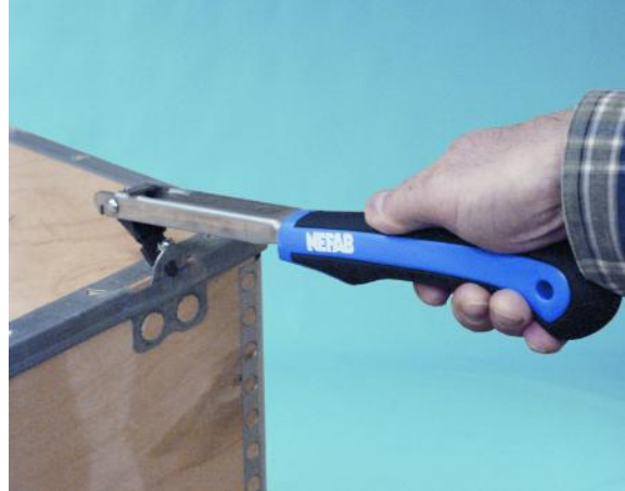
6. Seal the tongues...