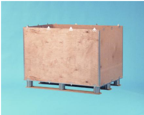
3. Put the frame on the bottom.