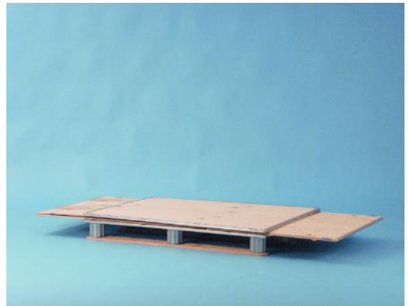
2. Collapsed box.