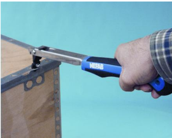
7. ...through bending them...