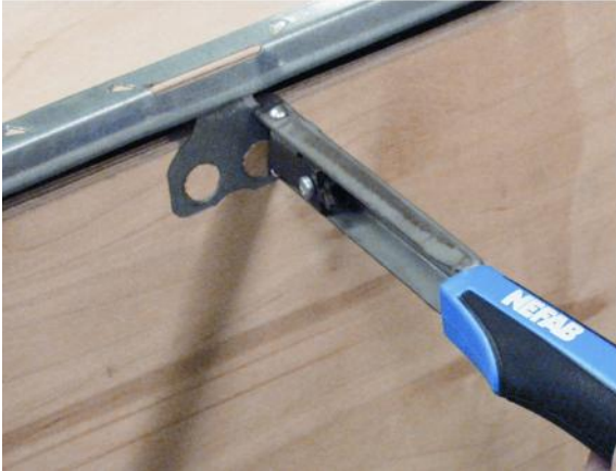
5. Make sure the tongues go into the slots in the profile.