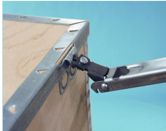
8. ... 180 degrees with help from a Nefab tool or similar.