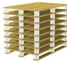
Light weight pallets are suitable for storing in racks