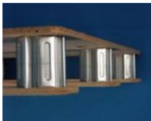
Steel cylinders are very durable