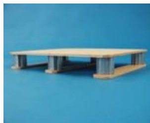
Plywood pallets are light and strong